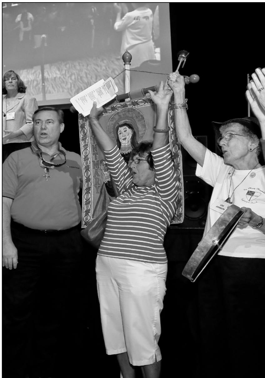
Members of St. Mary Magdalene Episcopal Church in Bradenton celebrate as their congregation is received as a parish at the beginning of the Convention of the Diocese of Southwest Florida on Oct. 9, 2010.